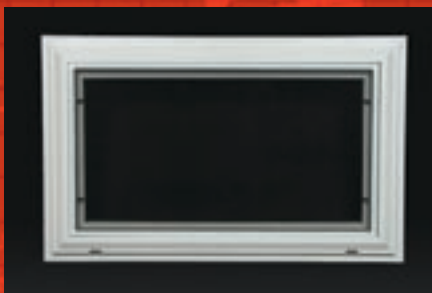
Vinyl Hopper Window