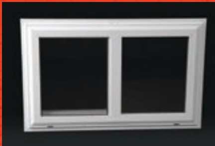
Double Glazed Vinyl Window