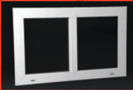
Single Glazed Vinyl Window