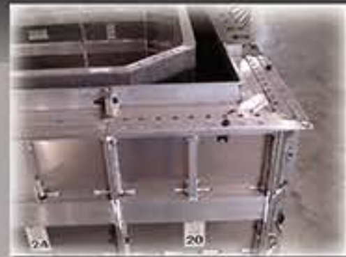
Haunch Corner with Header