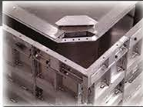
Haunch Corner with Deck