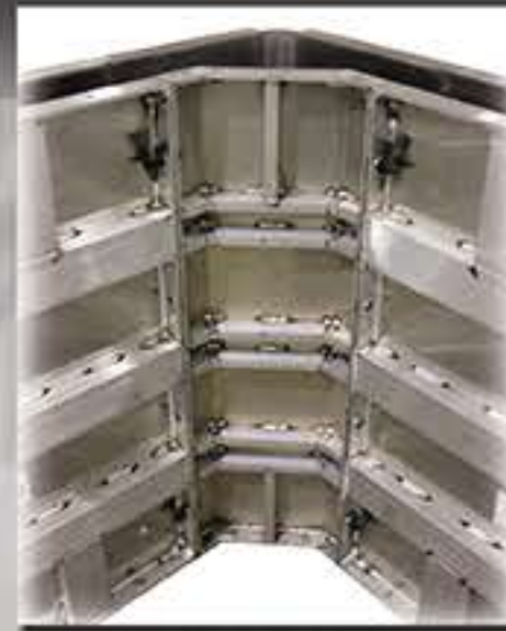
Standard Haunch Corner

The Haunch Inside Corner is common place in the Precast Industry and Precise Forms can provide the dimensioning required by your Engineer to comply with the designs you are confronted with.